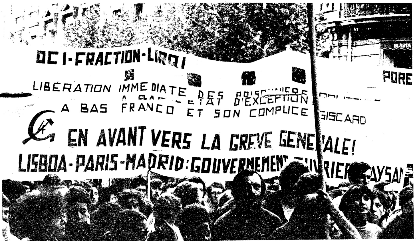
CONTINGENT OF FRENCH AND SPANISH SECTIONS OF THE INTERNATIONAL LEAGUE DEMONSTRATE AGAINST FRANCO