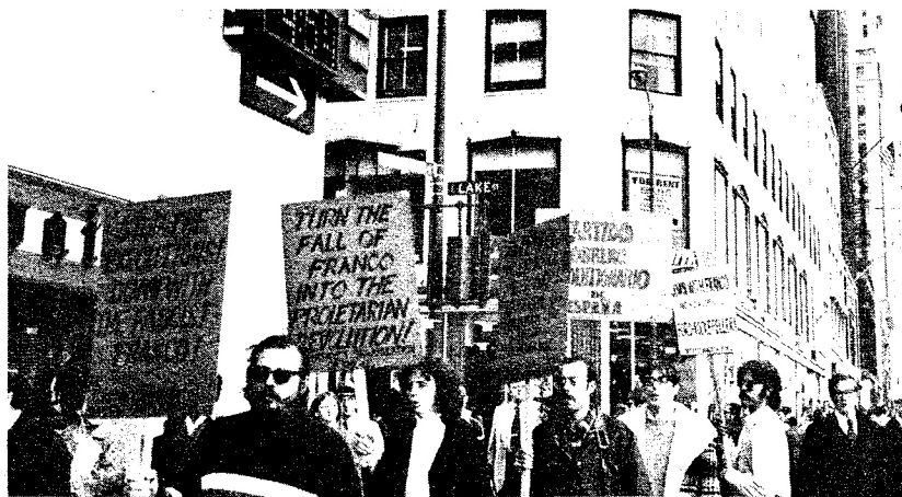
DEMONSTRATION IN CHICAGO AGAINST FRANCO

Newspaper of the PORE, Spanish Section of the International League, available from TRUTH.